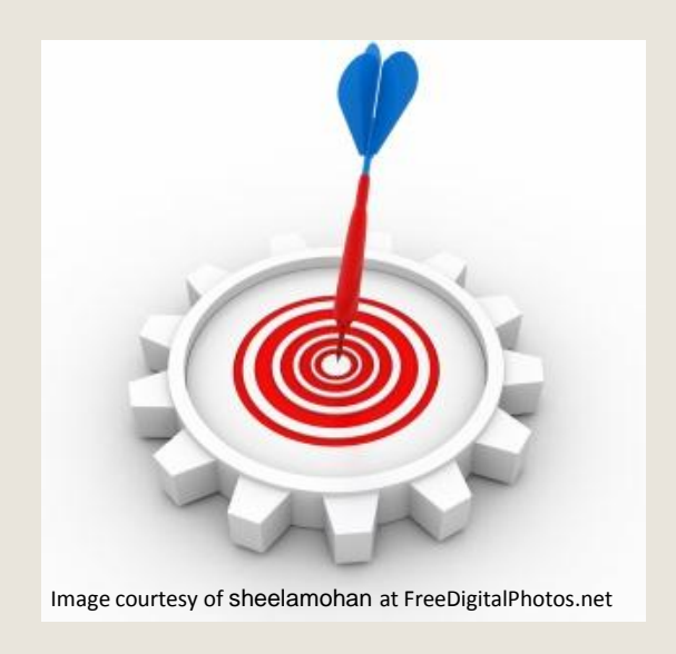
> Provide a kind of toolkit for mentors for relation with school management and workmates.

Provide information on organizational culture at schools;