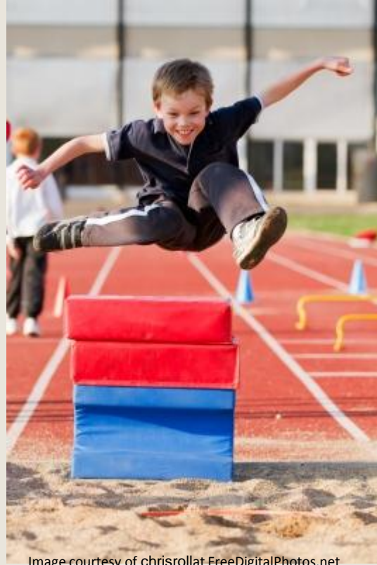
The teachers should encourage and invite students' parents (carers) to participate in the school life, including the organization of events and activities, and to initiate common activities. Teachers' role is to build good relations with students' parents (carers) and constructively solve the problems.